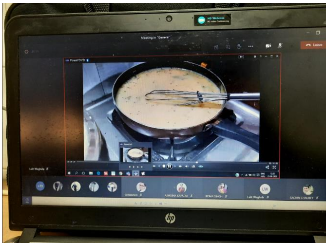
Online Cuisine demonstration Videos (Pic 3)