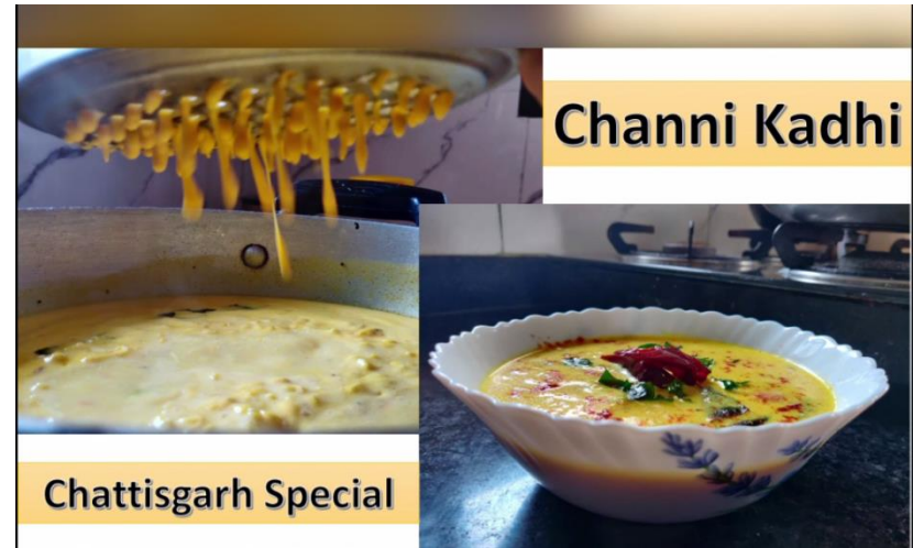
Online Cuisine demonstration - Chhattisgarh (Pic 2)