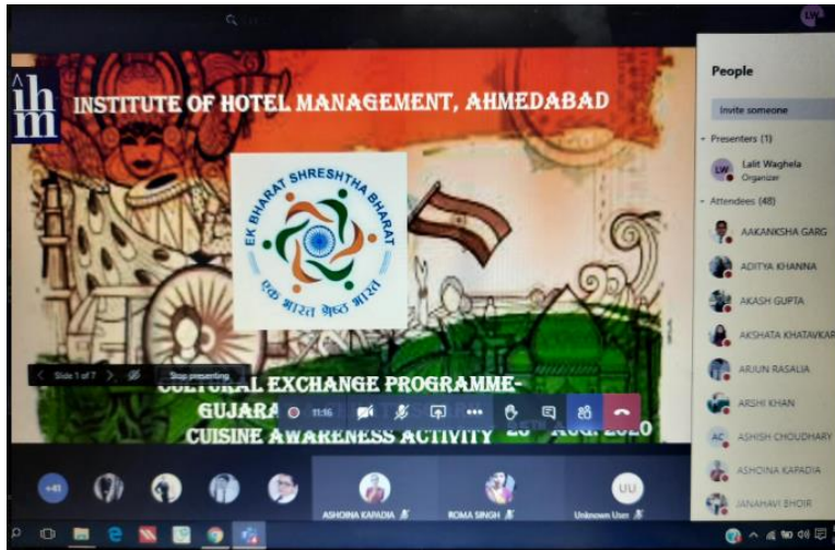
Online Cuisine demonstration Videos (Pic 1)